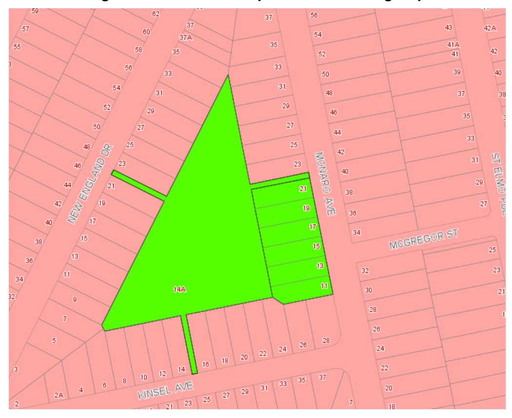
Figure 3 – Extract of Proposed Land Zoning Map