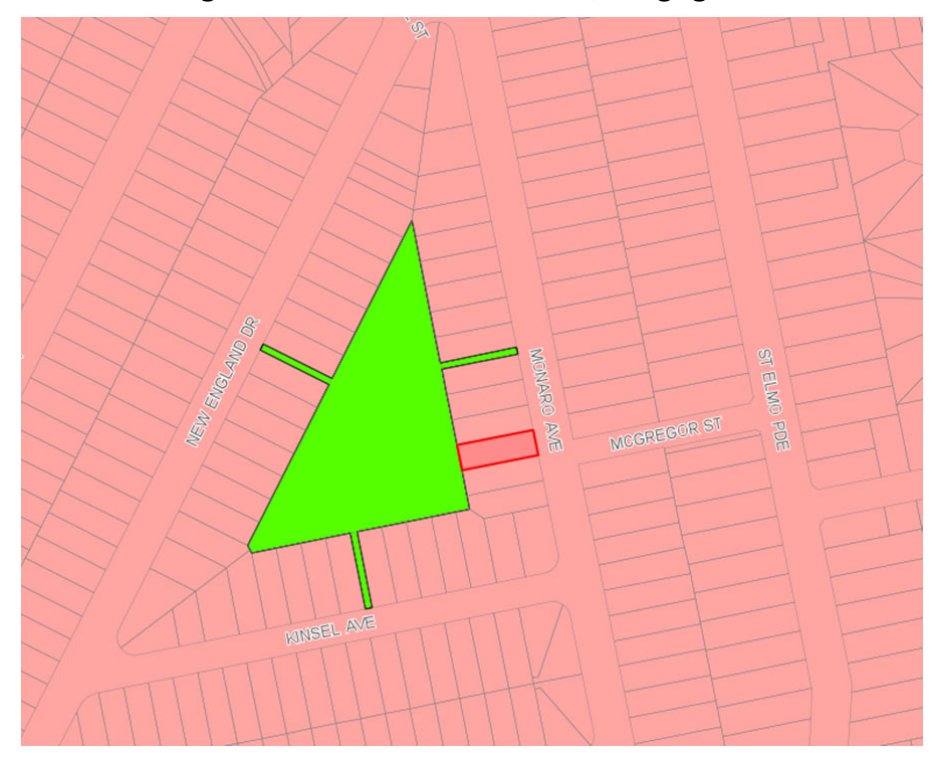
Figure 1 – 15 Monaro Avenue, Kingsgrove

8. The Council staff continues to have discussions with a number of the properties adjoining the reverse regarding the purchase of their land.